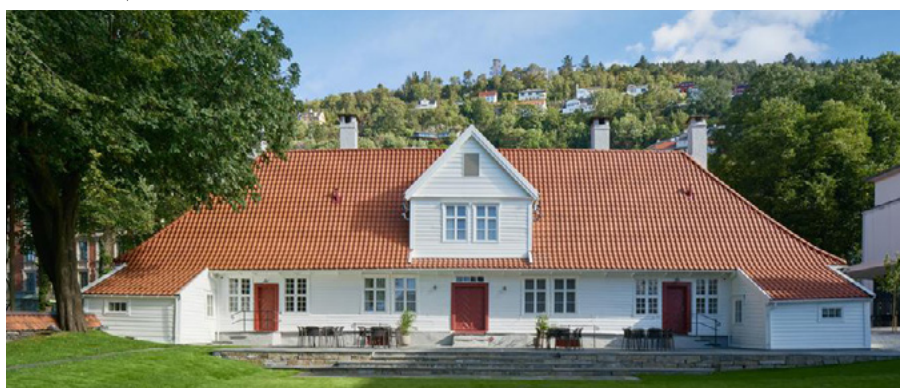
Villa Terminus

Arrival/social event Informal pre-gathering at → Villa Terminus