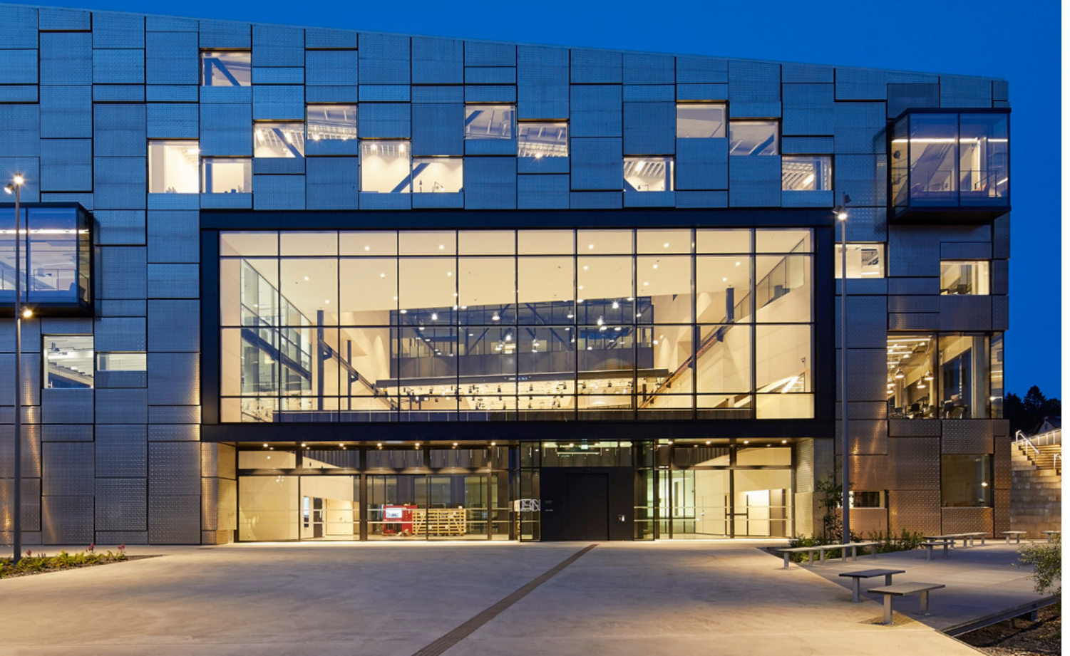
Faculty of Fine Art, Music and Design (KMD)